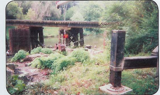
Clamshell Clearing Waterway Log Jam