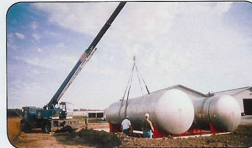
Agriculture Tank Farm