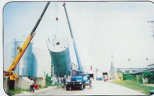
Industrial Hopper Bins